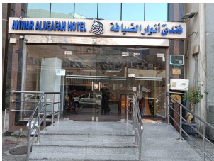
Anwar Deafah Hotel (OR Similar)