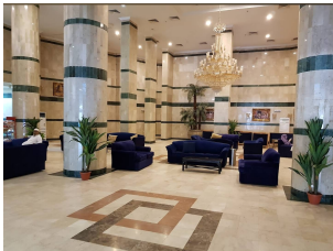
Burj Mawadda (OR Similar)