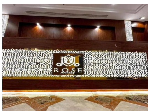
Rose Holidays (OR Similar)