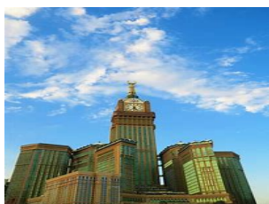
Clock Tower (OR Similar)