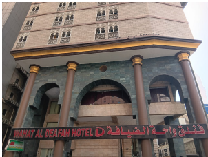
Wahet Al Deafah Hotel (OR Similar)