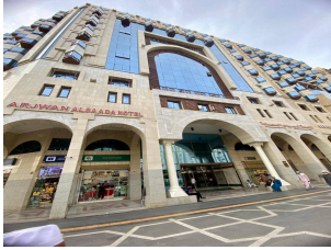
Erjwaan Saada Hotel (OR Similar)