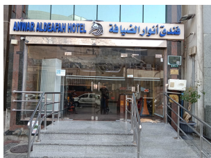
Anwar Deafah Hotel (OR Similar)