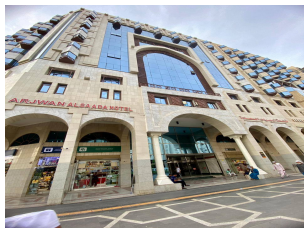
Erjwaan Saada Hotel (OR Similar)