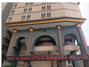
Wahet Al Deafah Hotel (OR Similar)