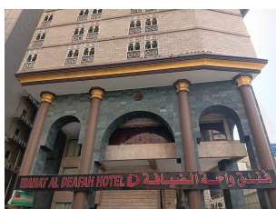
Wahet Al Deafah Hotel (OR Similar)