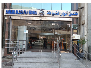
Anwar Deafah Hotel (OR Similar)