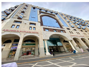
Erjwaan Saada Hotel (OR Similar)